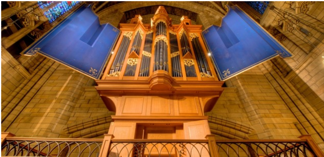
Taylor & Boody Organ Specifications - http://stmarksberkeley.org/wp-content/uploads/2021/02/Taylor-and-Boody-Organ-Specifications.pdf