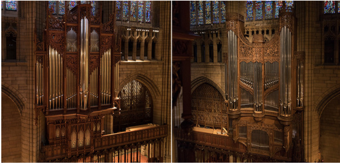
Miller Scott Organ Specifications - http://stmarksberkeley.org/wp-content/uploads/2021/02/Specifications-for-the-Miller-Scott-Organ-2.pdf